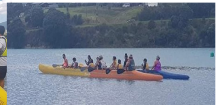
Ngaa tuaakana o Te Aahuru